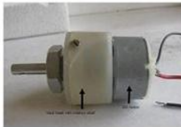
Fig 5. Bi-directional linear DC Motor

Dc motors are increasing in popularity due to their performance advantages over ac motors. Advantages of DC motors include Speed control over a wide range both above and below the rated speed, High starting torque- have a starting torque as high as 500% compared to normal operating torque, Accurate steep less speed with constant torque, Quick starting, stopping, reversing and acceleration, Free from harmonics, reactive power consumption and many factors which makes dc motors more advantageous compared to ac induction motors.