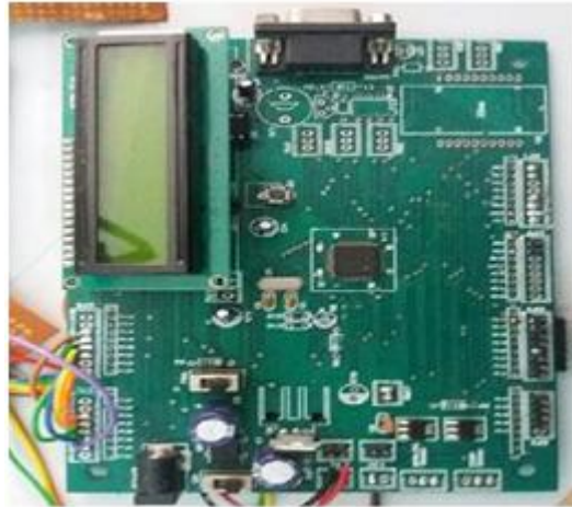
Fig 2. ARM7 LPC2148

A passive infrared sensor (PIR sensor) is an electronic sensor that measures infrared (IR) light radiating from objects in its field of view. They are most often used in PIR-based motion detectors. PIR sensors are incredible, they are flat control and minimal effort, have a wide lens range, and are simple to interface with. A PIR or a Passive Infrared Sensor can be used to detect presence of human beings in its proximity.