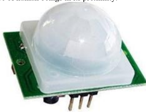
Fig 3. PIR sensor

A passive infrared sensor (PIR sensor) is an electronic sensor that measures infrared (IR) light radiating from objects in its field of view. They are most often used in PIR-based motion detectors. PIR sensors are incredible, they are flat control and minimal effort, have a wide lens range, and are simple to interface with. A PIR or a Passive Infrared Sensor can be used to detect presence of human beings in its proximity.