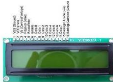
Fig 4. LCD display